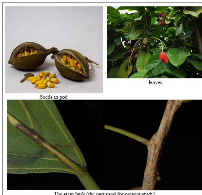
Fig 2: pictural view of Sterculia oblonga

eaten roasted or raw. Handbags, hats, rope, paper, and other items are made from the bark's fibers. The wood can be used to build little furniture pieces, like cupboards, or matchsticks.