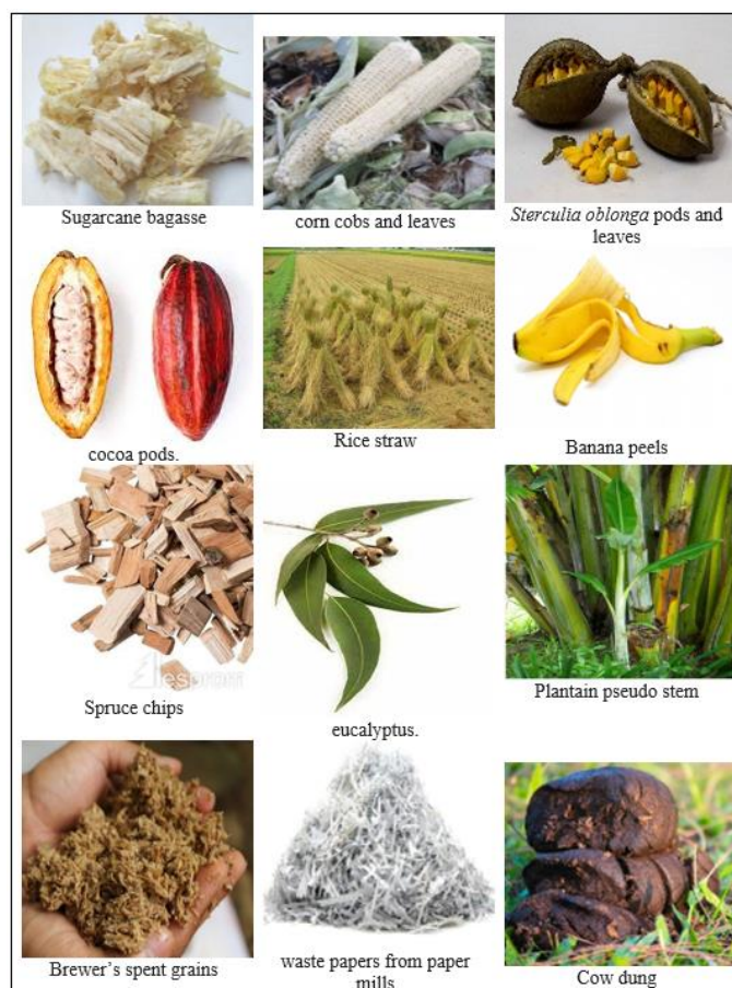
Fig. 1: common sources of lignocellulosic materials

The biopolymers called hemicellulose, cellulose and lignin, which have demonstrated antimicrobial properties, make up most lignocellulosic materials 1 . One of the most prevalent natural materials, lignocellulosic materials have favorable qualities like low density and biodegradability. They are also readily available, cheap, and environmentally friendly. Massive amounts of lignocellulose are extracted from agricultural waste, but only a small amount of that is used since lignocellulose's biotechnological significance is not well understood 2 . The amount of lignocellulosic content available in a material varies. Considering the enormous amount of chemical compounds available in the extract from these biopolymeric materials, there are countless prospects for the development of new drugs 3 . For instance, example aqueous extracts from willow leaves ( Salix sasaf ) have been reported to be effective against Guman carcinoma cells and have been tested in vivo and in vitro 4 ; antimicrobial activity of Punica granatum has been reported to be effective against all test microorganisms 5 . The heavy dependency of people on traditional medicine for primary health care has prompted in-depth research into plants to enhance their curative properties 6 . Some common sources of lignocellulosic materials are shown in Fig. 1.